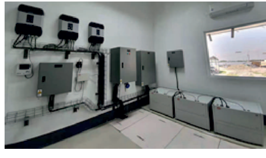
PowerPro Protection Supply Inc.

Owned and developed by Sindicatum Renewable Energy Company, the project is located on a 62-hectare land near Barangay Sta. Rosa in Region III, Philippines. The project needed an efficient and reliable backup system to be able to secure an uninterrupted power supply at the solar plant in an event of power failure. Moreover, the necessity for a backup system will ensure the plant's safety and reliability, so that in case of power interruptions, the control and monitoring room will remain operational until the power resumes.